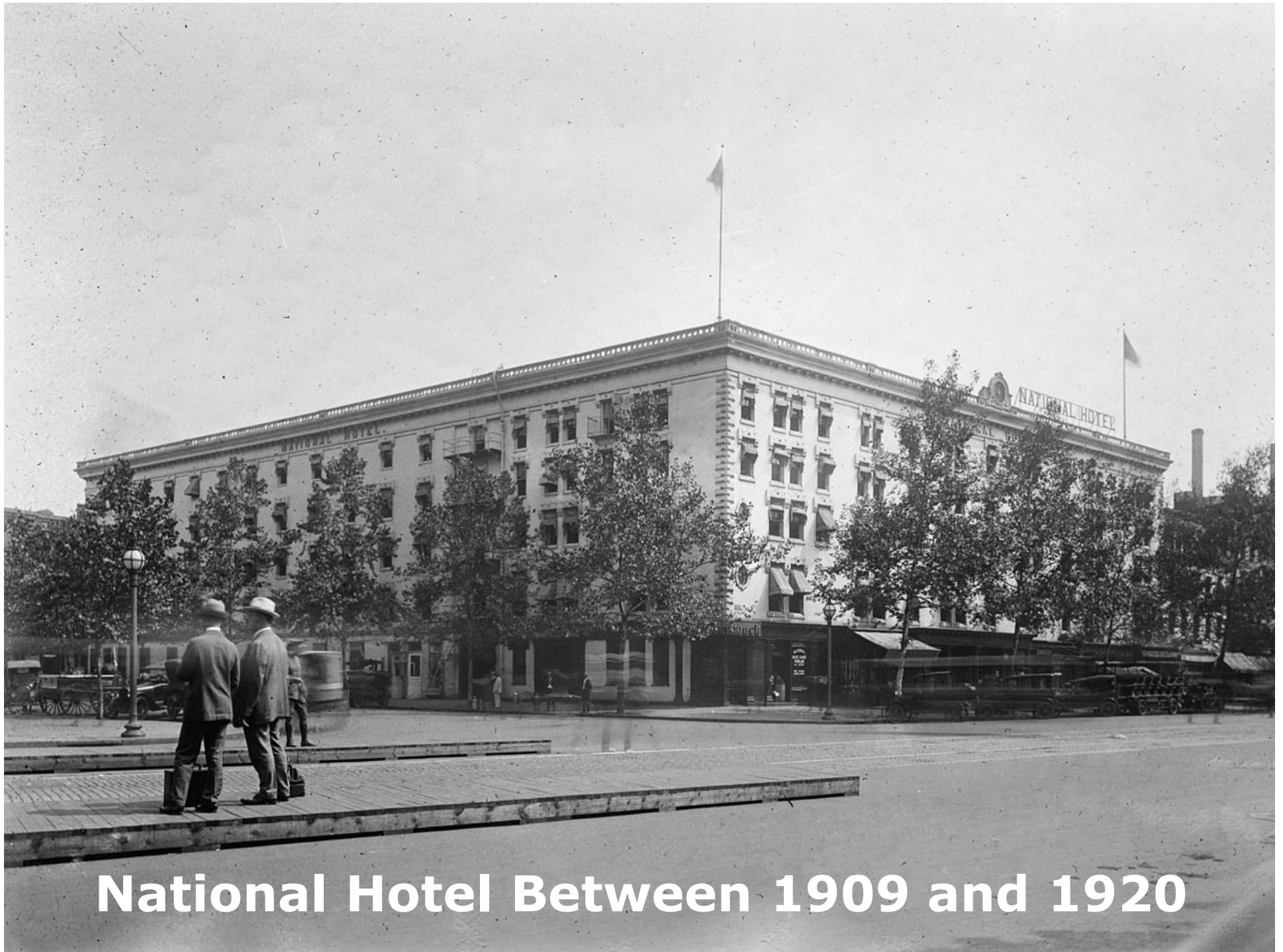
National Hotel Between 1909 and 1920