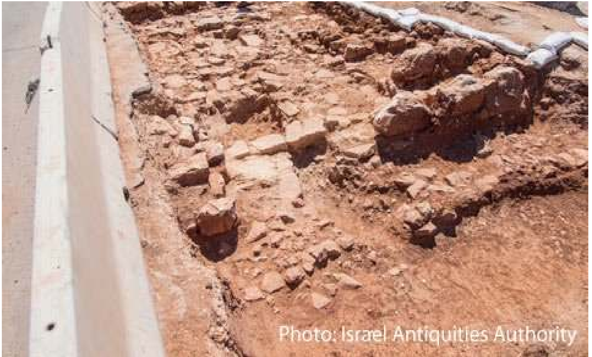
Ancient Roman road connecting Jerusalem to the coastal city of Jaffa (now Tel Aviv)