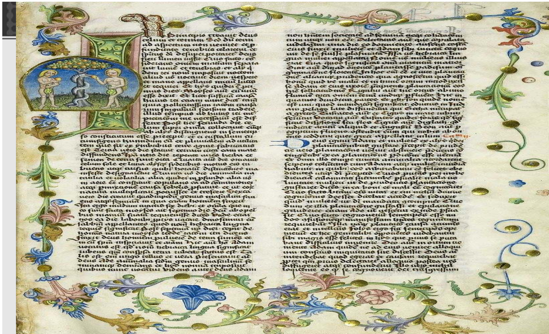
A Leaf from the 1466 Manuscript National Library of Poland