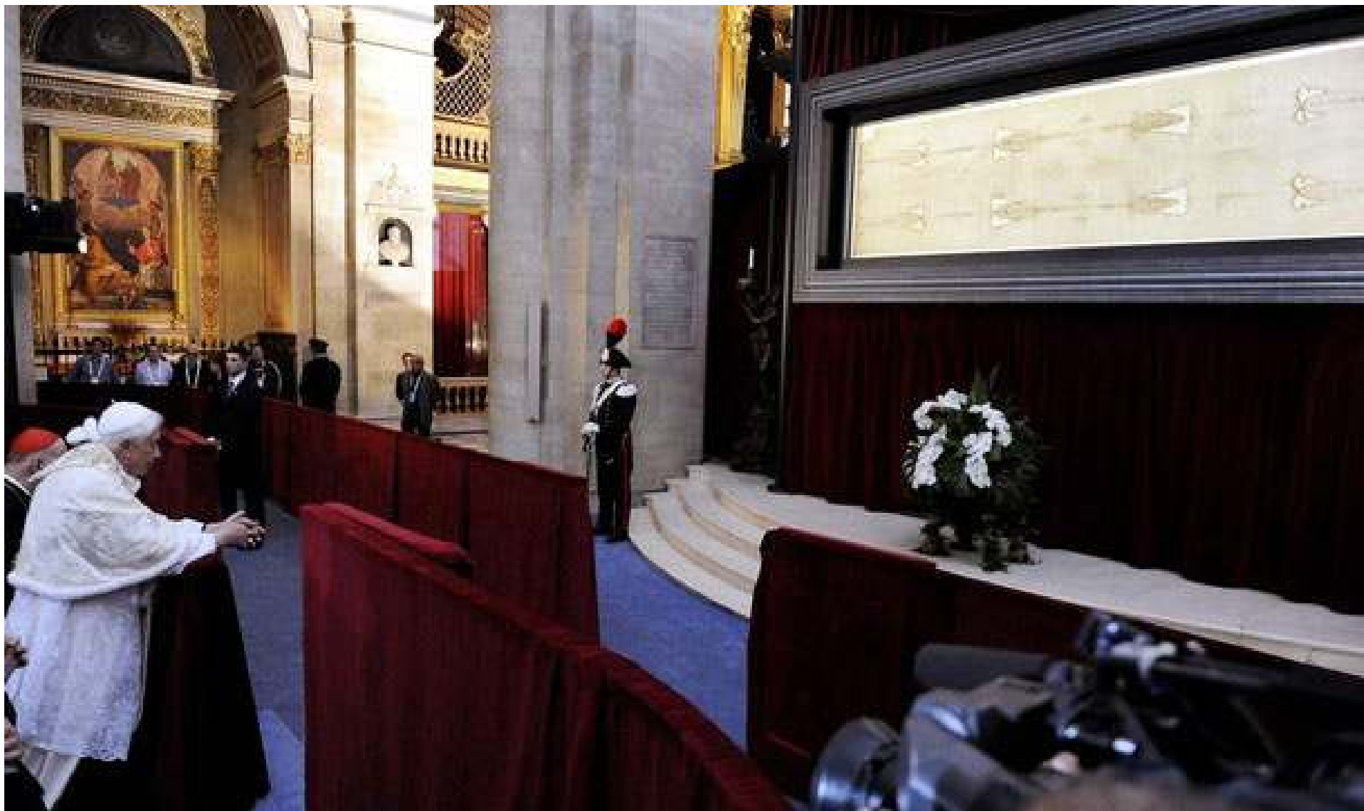
Pope Benedict XVI Viewing the Shroud in 2010